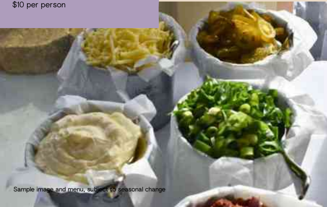
Sample image and menu, subject to seasonal change

This station is replenished throughout the service duration, runs for 45-minutes, and is designed to be served during pre-drinks or following dessert service.