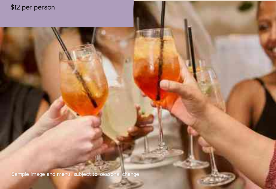
Sample image and menu, subject to seasonal change