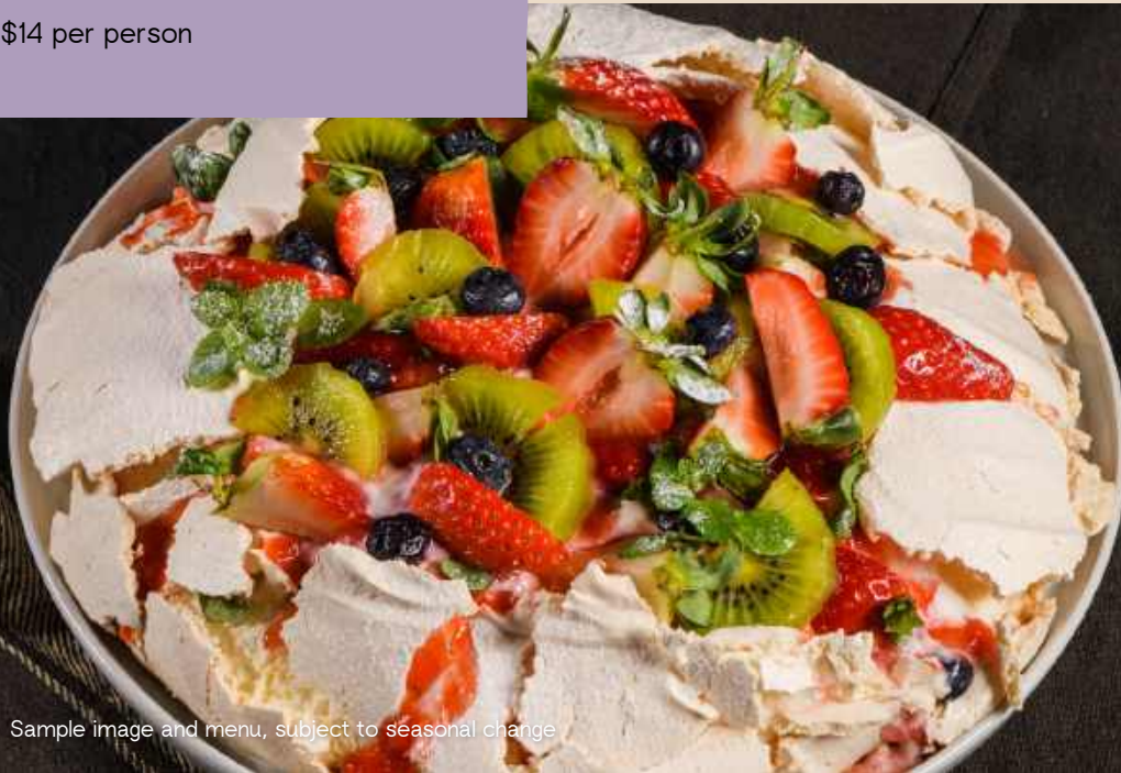
Sample image and menu, subject to seasonal change

This experience is not replenished throughout the service duration, as the food quantity provided is tailored to your guest numbers. This experience runs for 45-minutes, and is designed to be served following dessert service.