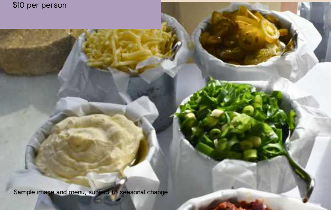
Sample image and menu, subject to seasonal change

This station is replenished throughout the service duration, runs for 45-minutes, and is designed to be served during pre-drinks or following dessert service.