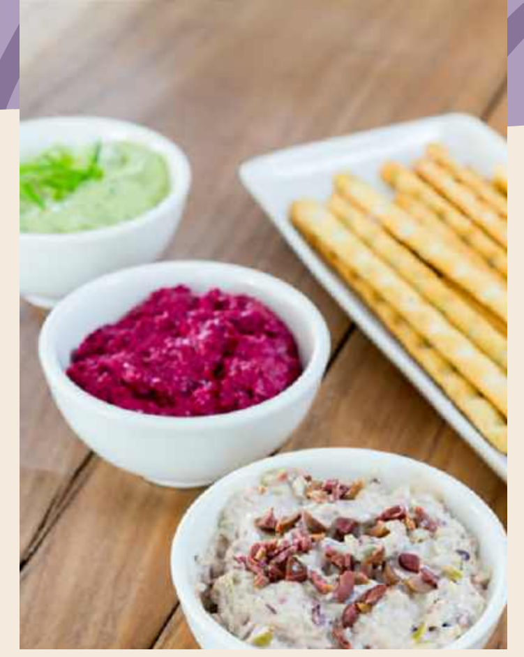
DIP PLATTER $8.00 pp

* Choice of dip or antipasto platter is included in our Gold and Platinum Wedding Packages