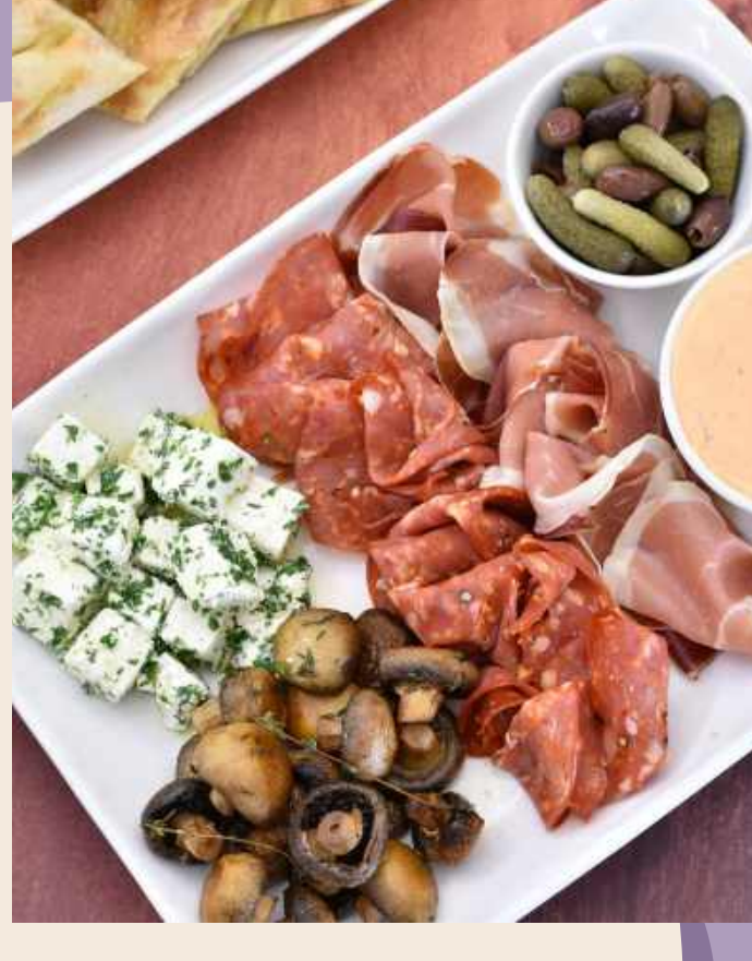
ANTIPASTO PLATTER $12.00 pp

Middle Eastern beetroot, spinach & feta, & black olive dip served with flat bread & bread sticks